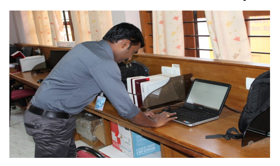
Computer maintenance and ID card printing facility