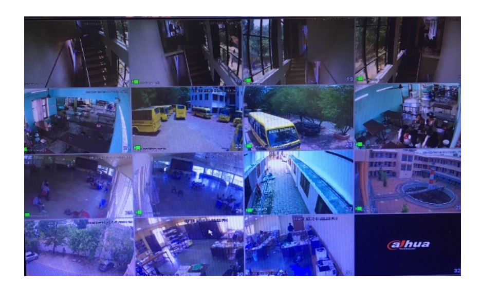
View from different cameras installed in the campus