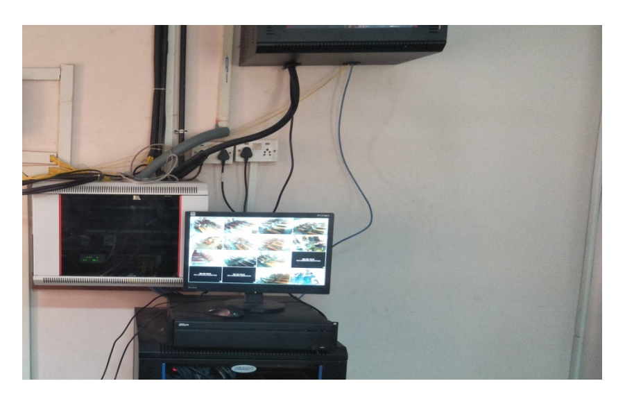
Real Time monitoring Facility